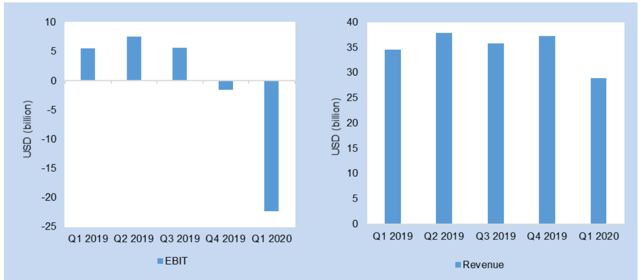
Figure 2a (LHS): Total EBIT (in USD billion) of Canada domiciled oil and gas firms from the first quarter of 2019. Figure 2b (RHS): Total revenue (in USD billion) of Canada domiciled oil and gas firms from the first quarter of 2019.

One of the reasons for the higher credit risk of Canada domiciled oil and gas firms is the fall in profitability. In March, WCS fell 88%, from USD 35 per barrel to USD 3.80 per barrel by the third week of April. The crash of WCS coupled with major cities under lockdown caused demand to fall and the industry profitability to dip to its lowest in the first quarter of 2020 (see Figure 2a). Meanwhile, total revenue for Canada domiciled oil and gas firms also dropped by USD 8.4bn in the first quarter of 2020 (see Figure 2b). Furthermore, containment measures in 187 countries and territories that brought mobility to a pause had led to predictions that 2020 will see a <u>fall in oil consumption of record 8.1mb/d</u>, the <u>biggest annual contraction</u> in history. Unsurprisingly, Canada oil and gas firms are not exempted from this global trend - crude oil exports in Canada had <u>plunged 55%</u> (i.e., USD 3.6bn) in April. Canada's imports of energy products also fell by over 50% as Canadian refineries slowed down (or some even completely stopped) operations in April due to COVID-19.